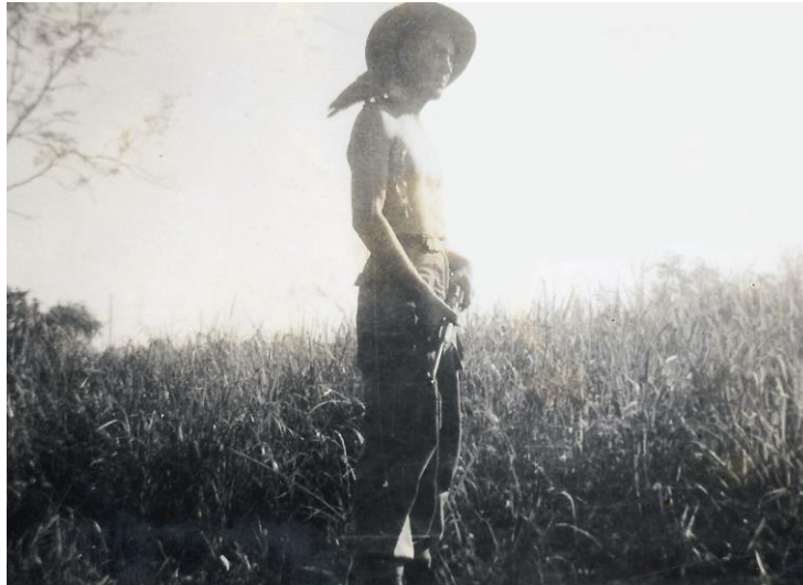
Philippines, 1944, On jungle patrol