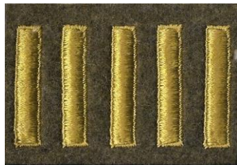
Overseas Service Bars