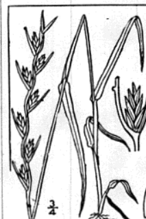
ABOUT DARNEL. Seeds of the Plant Are Not Poisonous as Is Supposed by Some People.

The seeds of the Lolium temulentum, "darnel," "poisonous darnel," have been reported poisonous but this quality is at least questionable, for other grass has gained such an unenviable reputation. In the specimen shown in the illustration the flower