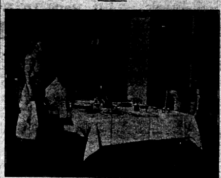
Formal Dinner, Served With a Maid. Flowers obstructed the view of the table, hence they were omitted.