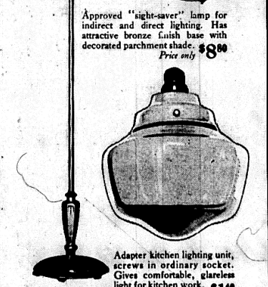
Approved "sight-saver" lamp for indirect and direct lighting. Has attractive bronze finish base with decorated parchment shade. Price only $8.00