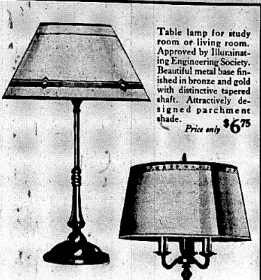
Table lamp for study room or living room. Approved by Illuminating Engineering Society. Beautiful metal base finished in bronze and gold with distinctive tapered shaft. Attractively designed parchment shade. Price only $6.75