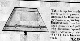
Table lamp for study room or living room. Approved by Illuminating Engineering Society. Price only $6.75